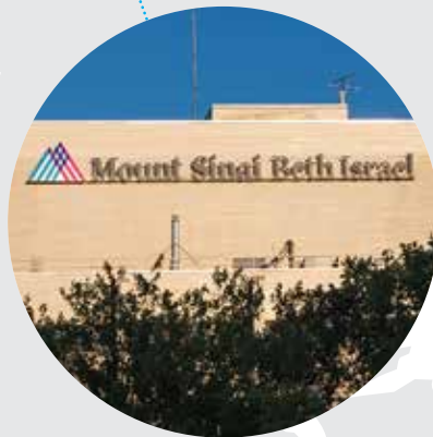
Mount Sinai Beth Israel

Icahn School of Medicine at Mount Sinai Mount Sinai Health System New York City