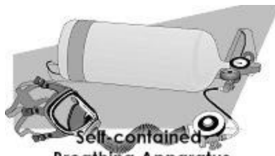
Self-contained Breathing Apparatus