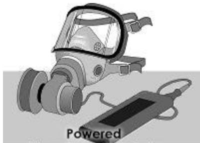
Powered Air-purifying Respirator