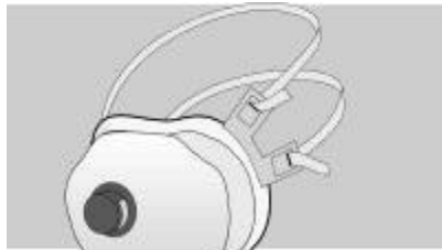
Disposable Half-facepiece Respirator