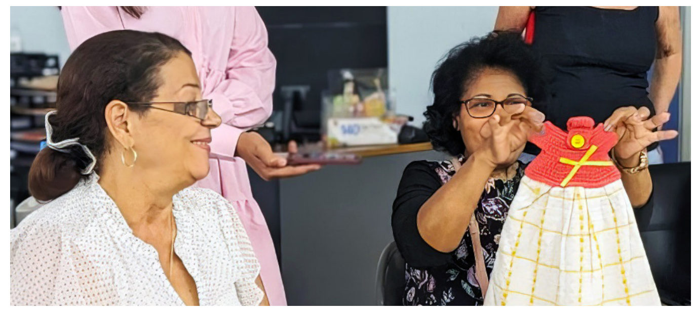
Participants at a 'Hope Bodega', an intergenerational storytelling event held at RiseBoro, a community partner organization, in June 2023.

We are dedicated to building bi-directional communication and authentic partnerships between academic and community partners while fostering the capacity of each in advancing health equity.