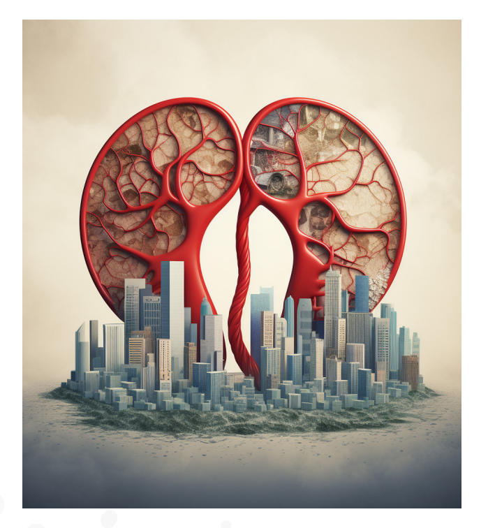
Dinushika Mohottige, MD, spoke with USA Today to discuss a flawed and biased kidney function test that overestimated kidney function in Black patients, masking the severity of their kidney disease and resulting in delays to appropriate treatment including kidney transplants. mshs.co/3SbsAzC