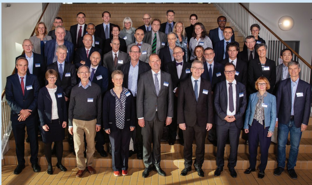
2019 Honorary Skou Professor Inauguration