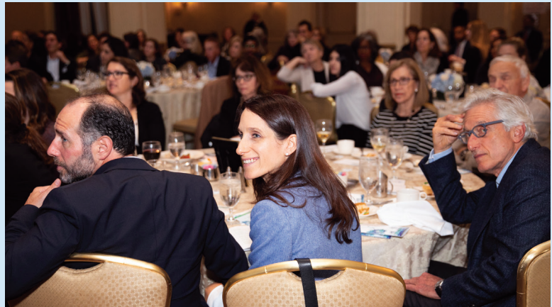
Attendees enjoying the video premier