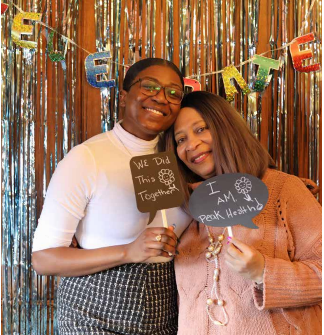
PeakHealth Wellness Program participants and leaders celebrate their accomplishments at the end of 12 weeks