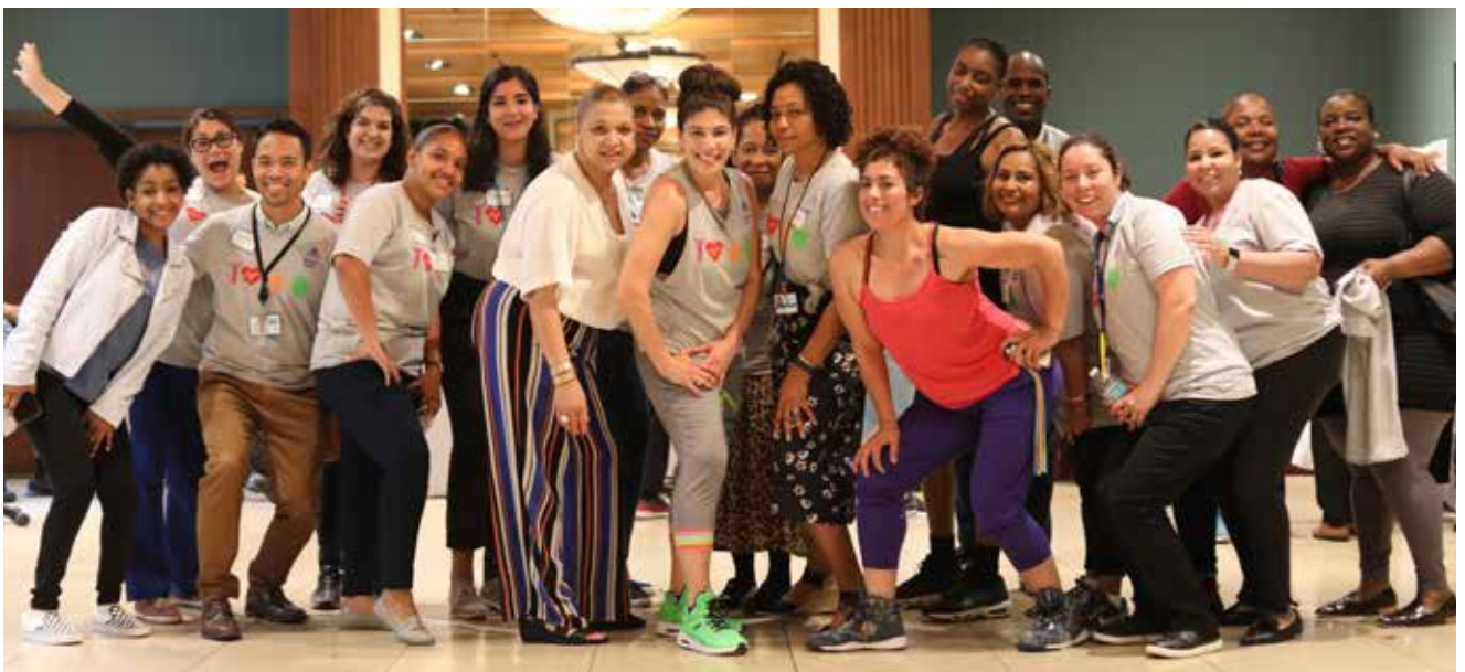
PeakHealth care team members participating in Wellness Day

In partnership with The Arnhold Institute of Global Health, the PHWP is funded by a grant from Teva Pharmaceutical Industries, as part of a larger agenda to establish and share interventions to support patients managing